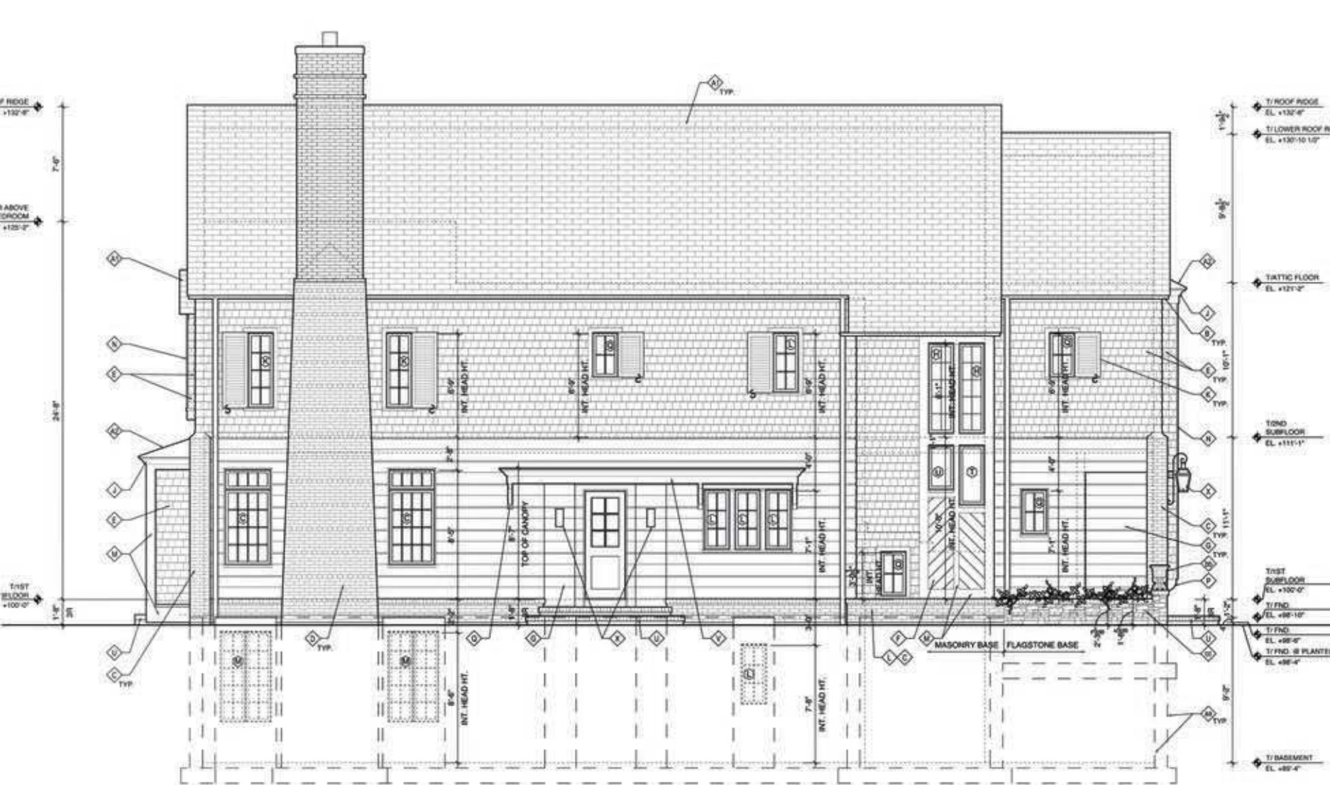
1 WEST ELEVATION SCALE 1/8" = 1'-0"